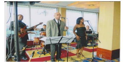
At 6:00 pm no-host cocktail reception accompanied by a live band playing smooth jazz and classic ballads.