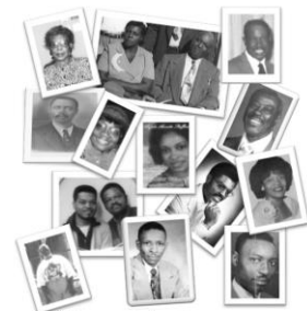
Loving each other, till we meet again.