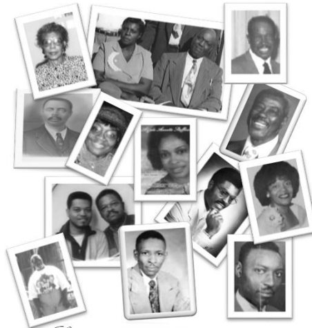
Loving each other till we meet again.